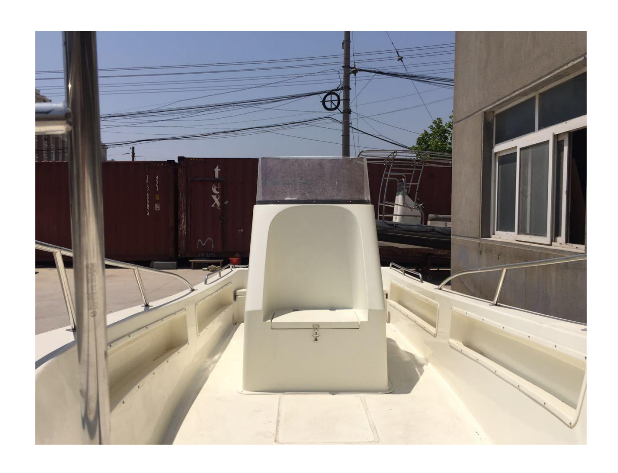
Large cuddy-consoley add USD1500.00