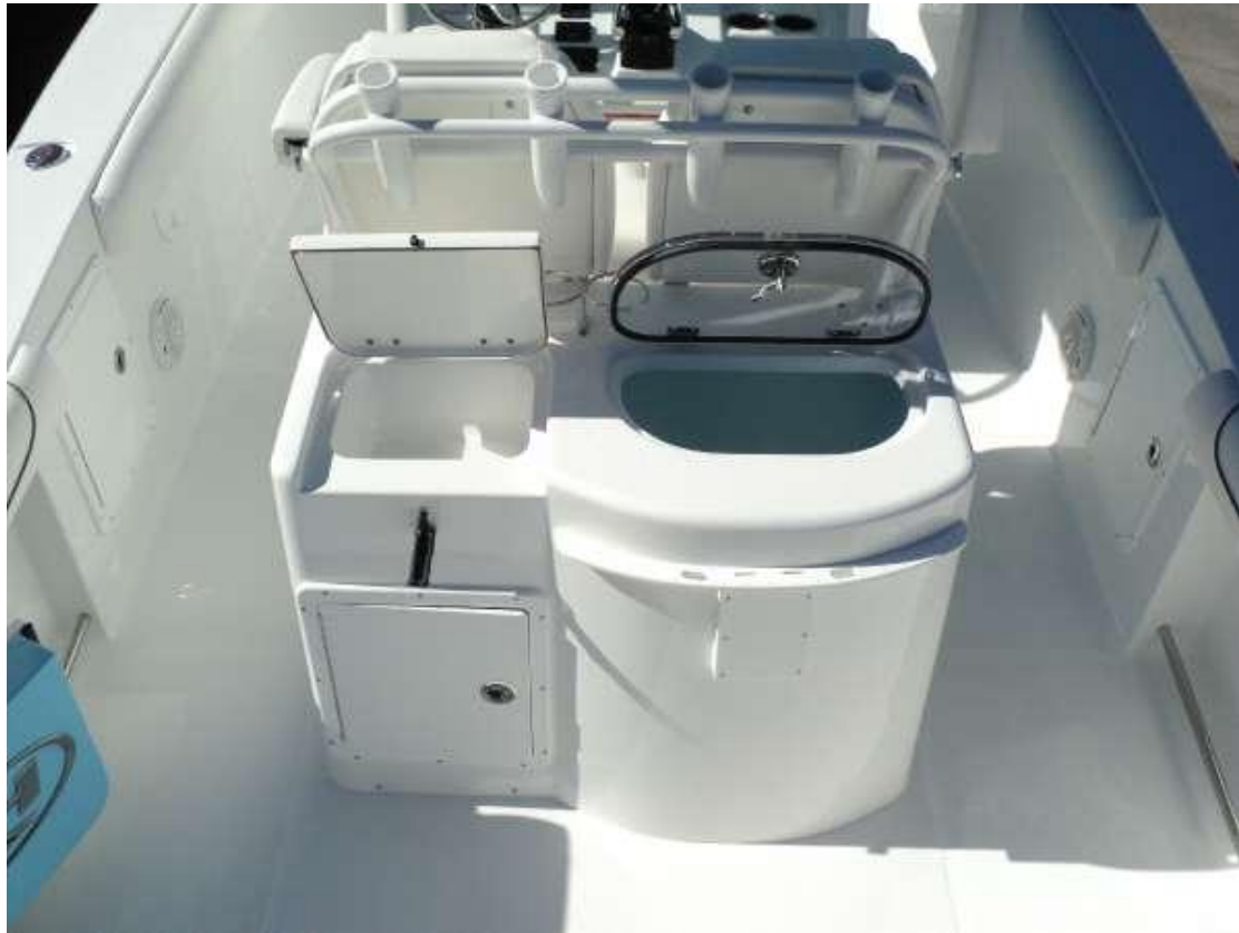
Driver chairs and sink tank and rod holders USD1000