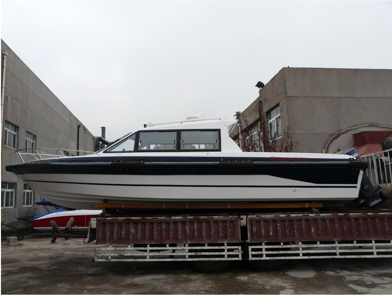
Side View 760/24'